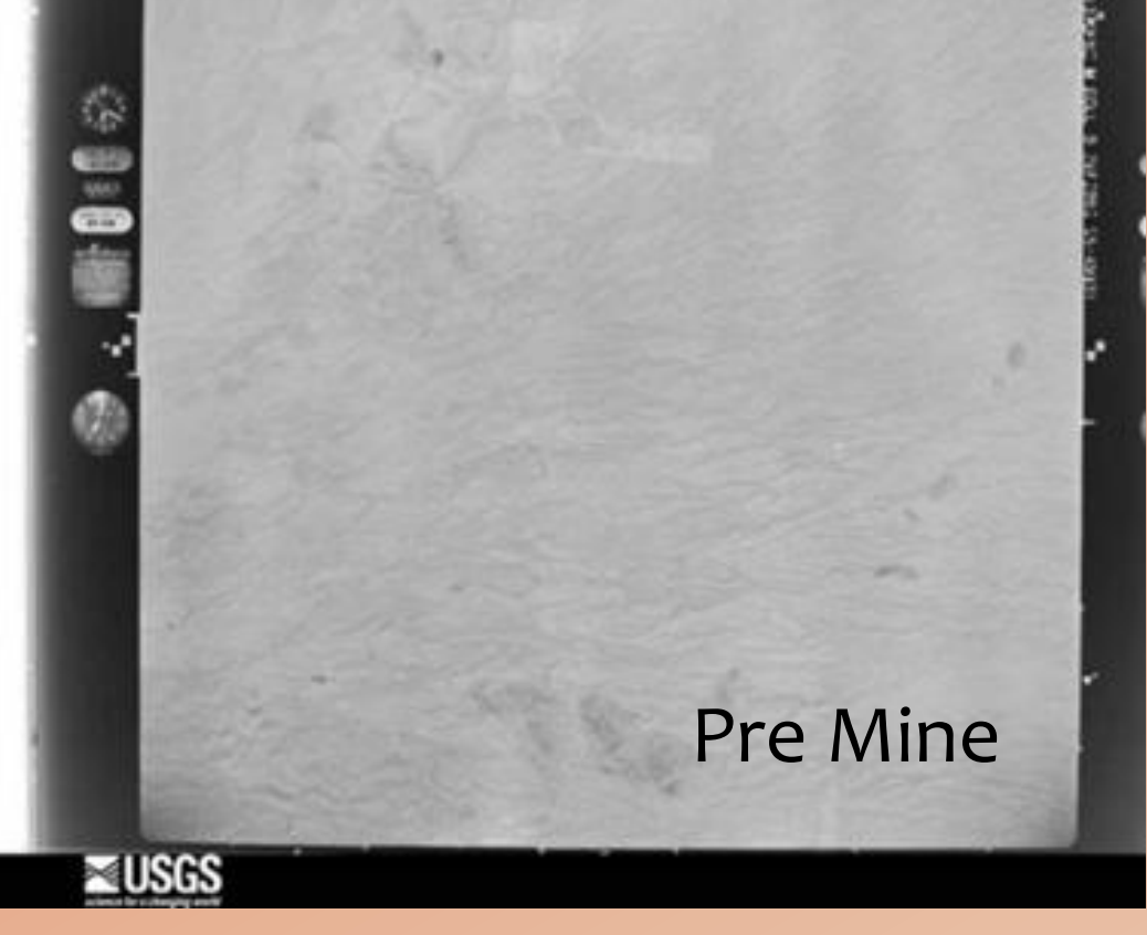
Army map service

Open Pit Mining: Rock is stripped away in a deepening pit to get at the copper ore below.