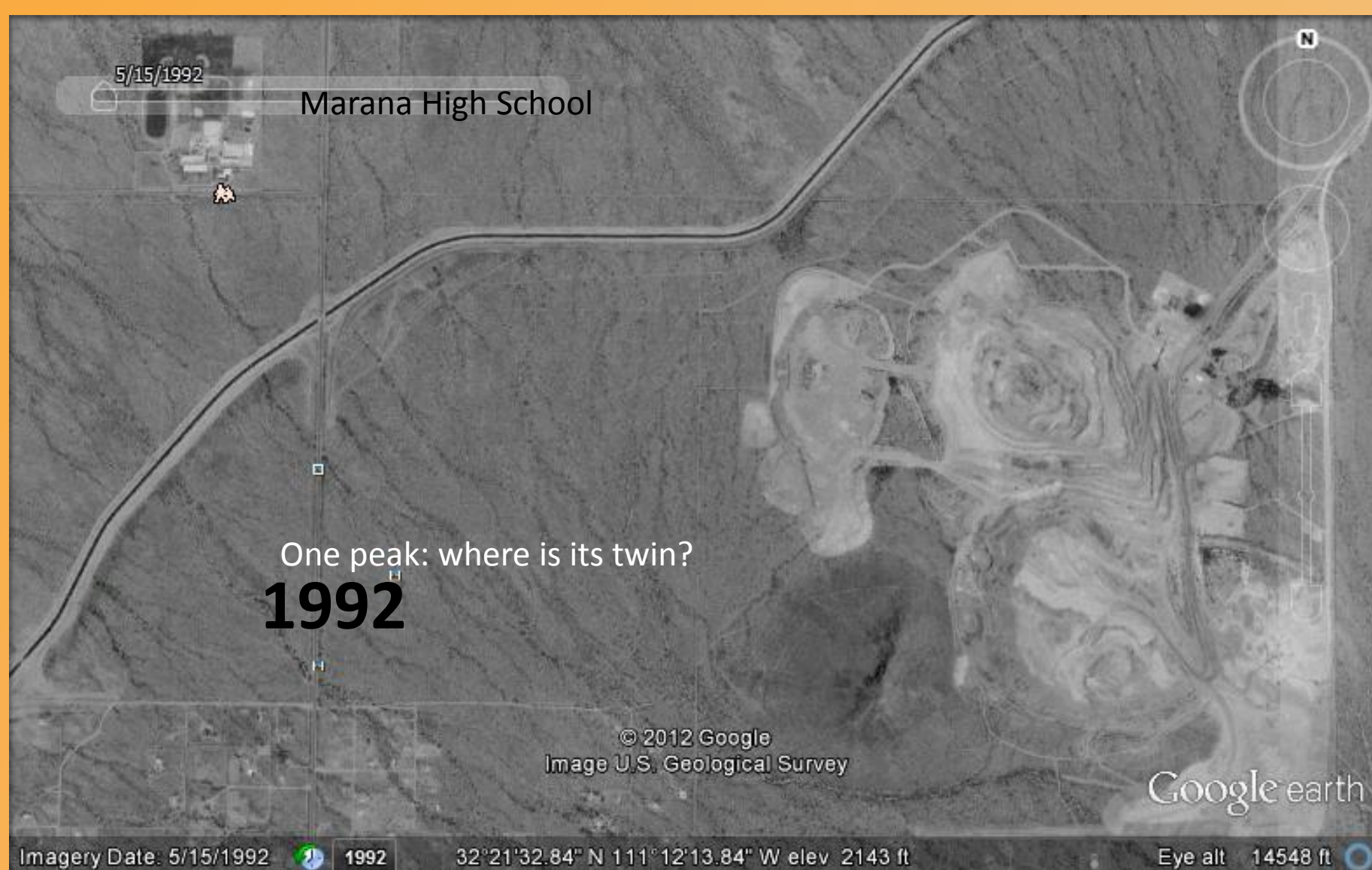
These satellite images of Twin Peaks mine show how much the mine has expanded over the years.

I have been living in the Marana area since 1994. Everyday, I drive past this mine and I watch it getting bigger and bigger. When will it stop?