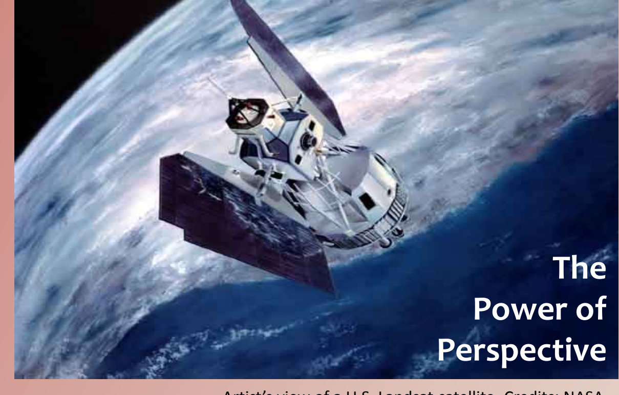
Artist's view of a U.S. Landsat satellite.

The Aspen Fire (2003) devastated parts of Mt. Lemmon. It was a high intensity fire that burned both mature and understory trees.