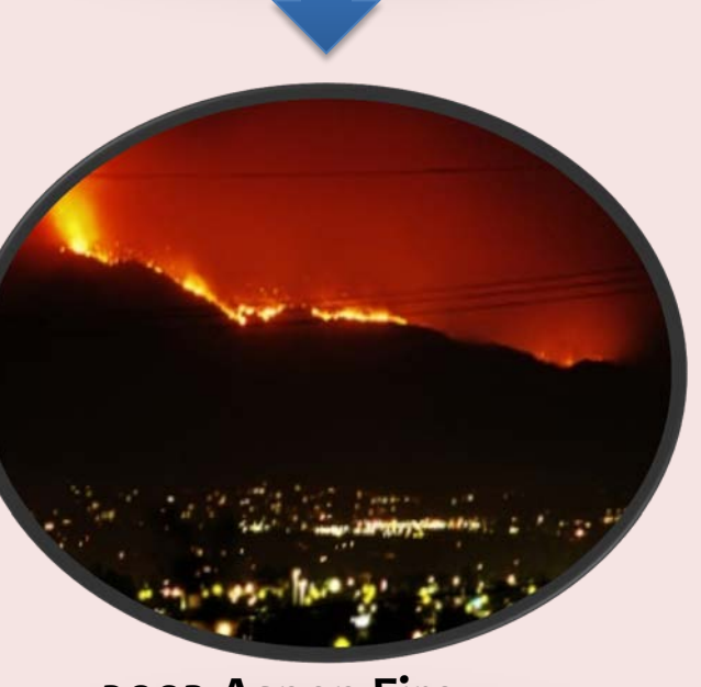
2003 Aspen Fire

The Aspen Fire burned on Mt. Lemmon from June 17, 2003 until July, 2003. The fire burned 84,750 acres and destroyed 340 homes and businesses. wikipedia.org/wiki/Aspen_Fire