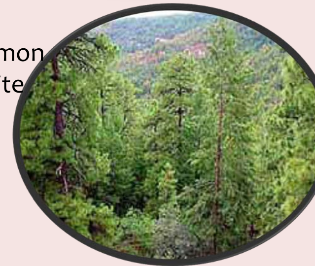
Forest Prior to Fire

Higher elevations on Mount Lemmon are dominated by Southwest White and Ponderosa Pines, with mixed conifer forest of Pine and Douglass Fir at the very top.