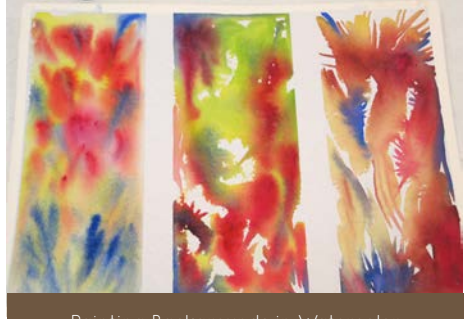
Painting Backgrounds in Watercolor

Discover your talent as an artist or work in the studio for fun, while you enjoy the surroundings at the Arizona-Sonora Desert Museum. The Art Institute program offers individual classes as well as a certificate of completion program in nature art. The unique backdrop of the Museum becomes your class-room while you have the option of drawing birds, mammals, insects and desert botanicals. You can also participate in a wide variety of classes and workshops including oil painting, nature journaling, mixed media and photography.