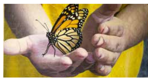
Jennifer Day, "Garden Wonder", quilt