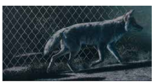
Andrew Denman, "The City Boy Blues", acrylic