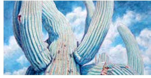
Terkanian, "Giant", acrylic on canvas